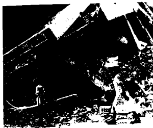
Figure 1.1 A massive landslide of rock and debris from a steep mountain slope, illustrating the potential hazards of geological processes.

A Closer Look: Easter Island: A Complex Problem to Understand 34